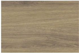
PALOMINO — MELAMINES (STANDARD)