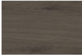
KODIAK — MELAMINES (STANDARD)