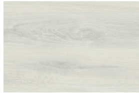
ALABASTER — MELAMINES (STANDARD)