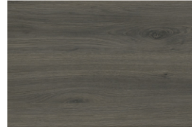
GIBRALTAR — MELAMINES (STANDARD)