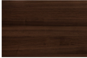
WALNUT — MELAMINES (STANDARD)