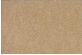
MDF (UNFINISHED) — (STANDARD)